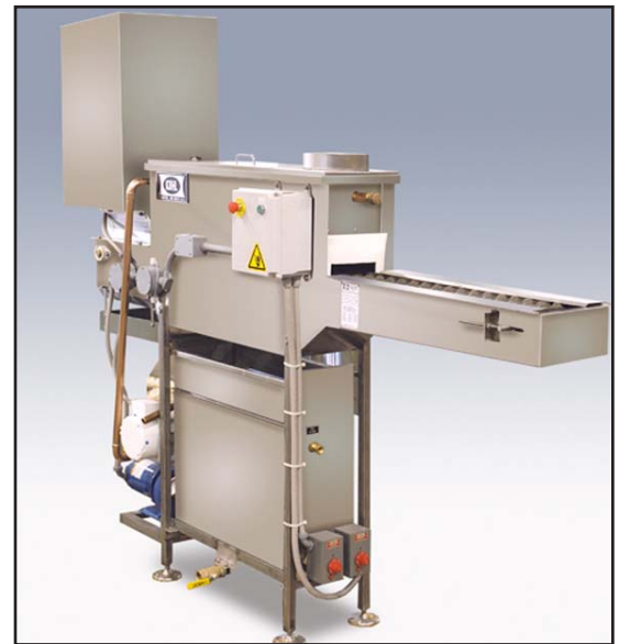
The EBEW 1-5 cleans eggs through a pressure spray wash and sanitizer spray.

Kuhl Corp. offers the EBEW 1-5, which processes from one to five cases an hour, or from 360 to 1,800 eggs. A recycled spray is used to clean eggs. Eggs are rotated on rubber rollers during cleaning and then pass through a sanitizing spray. A grader or farm packer can be attached.