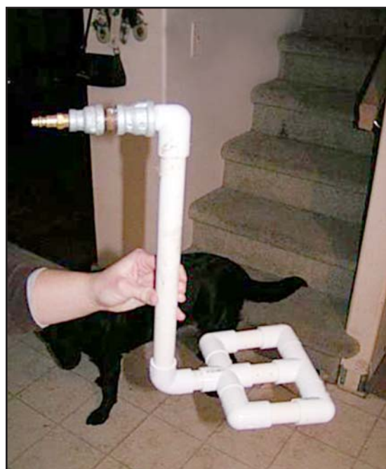
This is a homemade unit to clean eggs with water and bubbles. The unit is made with three-quarter-inch PVC pipe and drilled with a 3/32-inch bit.

Producer Mike Geubert described how to make a similar system on the farm. This can save on costs, especially if one already owns an air compressor. The bubbler system can be made with PVC piping with holes drilled throughout the base and an air coupler to connect to the compressor. The regulator on the compressor can be used to adjust the pressure to 10 to 5 pounds per