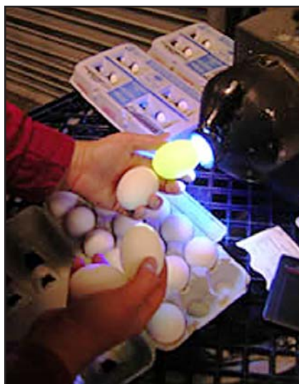
Candlers help ensure the interior quality of eggs.

According to Colorado State Extension, “a suitable light can be handmade by cutting a 1.25-inch diameter hole in the end of a coffee can. Insert a light bulb fixture through the lid, using a 40-watt bulb. View the interior of the egg by holding the large end up to the hole cut in the bottom of the can. As the light passes through the egg, twirl the egg several times. If blood spots are present, you will see them” (Geiger, 1995). Another low-tech way to candle is by taping a 3-inch length of empty bath tissue paper tube to a flashlight. Suppliers such as Nasco, Kuhl and Rochester Hatchery offer hand candlers.